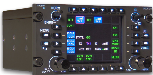
Audio Management Unit