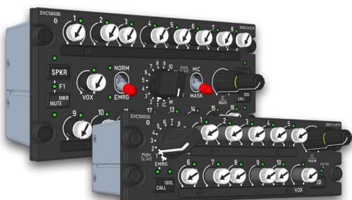
Audio Control Unit - ACU6520, ACU6521