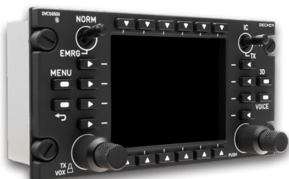
Audio Control Unit - ACU6510